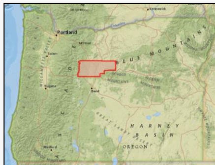
Above: Jefferson County is located in central Oregon, west of Sale and Mount Jefferson. Its largest city is Madras.

This county has no shortage of protected natural areas; it contains parts of the Deschutes, Mount Hood and Willamette National Forests, as well as the Crooked River National Grassland. This county sees 300 days of sunshine a year. Major tourist activities are fishing, hunting, camping, boating, water-skiing and rock hunting. Jefferson County also contains the Warm Springs Indian Reservation, home to the federally recognized Confederated Tribes of Warm Springs.